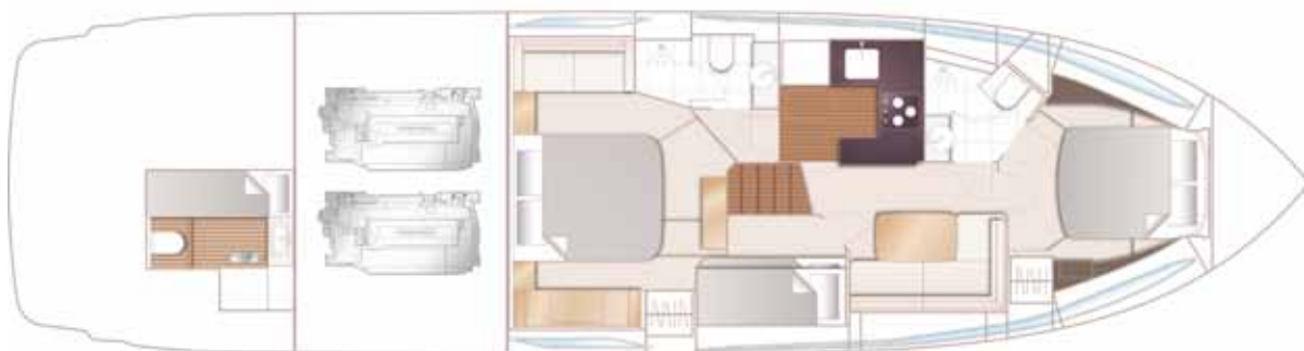
LOWER DECK - OPEN