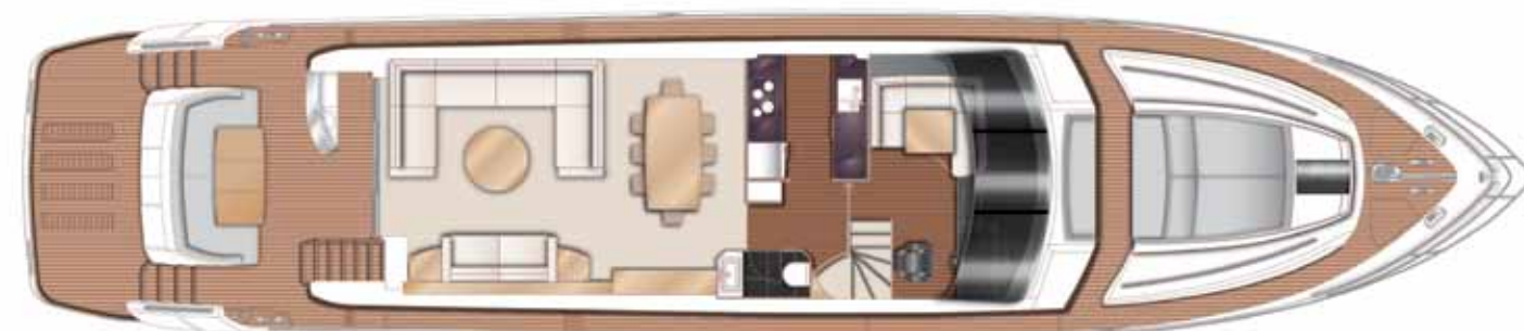
MAIN DECK WITH OPTIONAL DAY HEAD